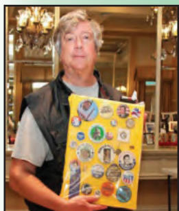
History at High Noon page 2