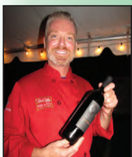
Boca Wine & Food Fest page 12

“Mockers stir up a city, but wise men turn away from anger.” – Proverbs 28:6.