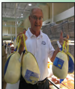
Hock Exchange Gives back page 5