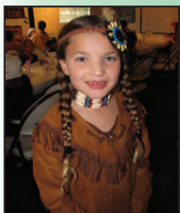
HCA Thanksgiving page 9