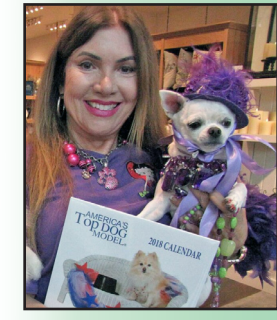
America's Top Dog