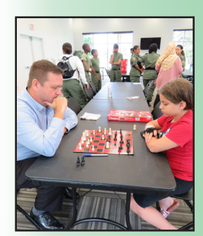
Mayor's Chess Challenge