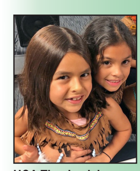
HCA Thanksgiving page 2