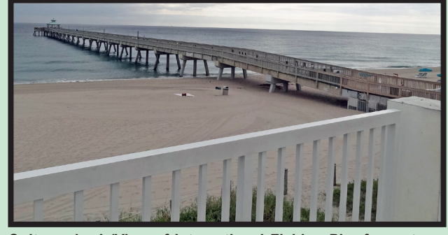
Quite a view! (View of International Fishing Pier from atop Pier Observation Deck).

Sea Scattering of Ashes $99 www.ashesatseabybolo.com