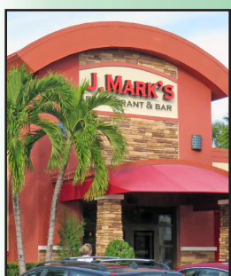
What's new at J. Marks