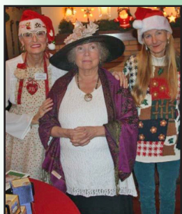
Home for the Holidays