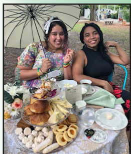
Teas & Trees