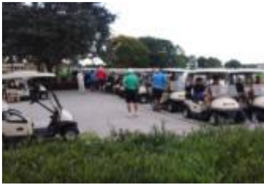
20 for 20 Golf Tournament at Heron Bay July 25, 2015