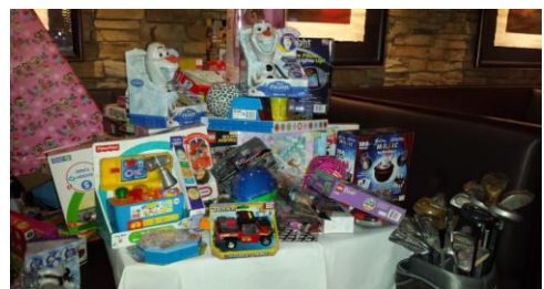
Pinon Grill Networking for a Cause, December 10, 2015. Toy donations for Holiday Special Touch