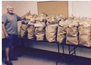
Food Pantry in Deerfield Beach